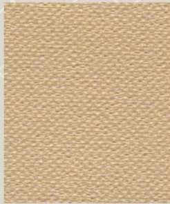
719 Tan (13oz) 719-LT Tan (8oz)