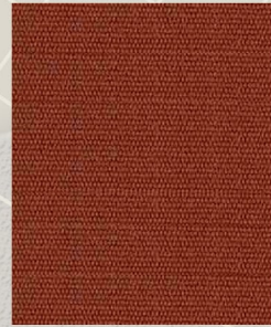
743 Terra Cotta (13oz) 743-LT Terra Cotta (8oz)