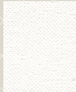
765 White (13oz) 765-LT White (8oz)