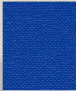
731 Ocean Blue (13oz) 731-LT Ocean Blue (8oz)