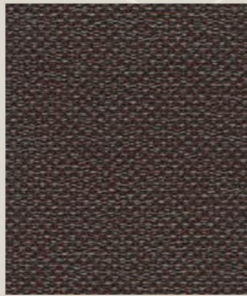
779 Chocolate Brown (13oz) 779-LT Chocolate Brown (8oz)