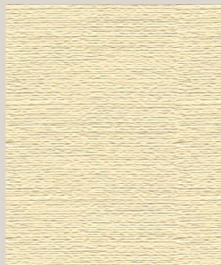
707 Ivory (13oz) 707-LT Ivory (8oz)