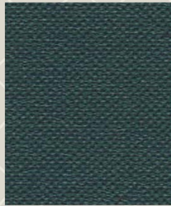
740 Hunter Green* (13oz) 740-LT Hunter Green*(8oz)