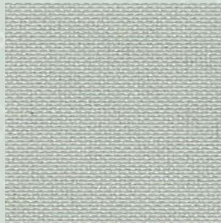
618 Silver Gray