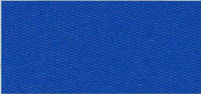
301 Caribbean Blue

Acrylic Coated Flame Retardant Polyester