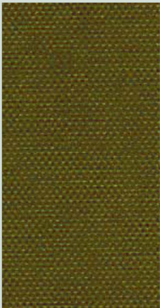
606 Olive Drab

Acrylic Coated Flame Retardant Polyester