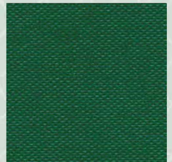
305 Forest Green